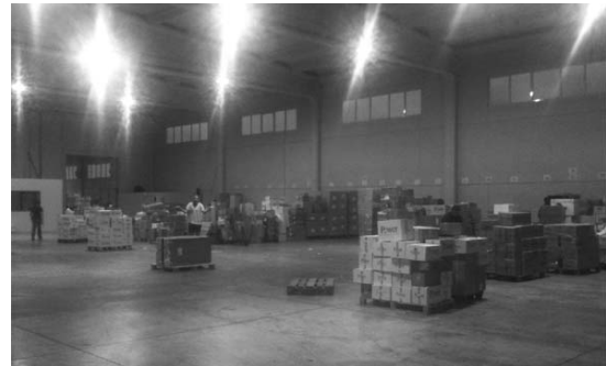
They've got to be in here somewhere...

'yes... err... box... Megaron...' was music to my ears as we found the man in reception. 'Come...' It suddenly dawned that we did not know how many boxes there were or even what they looked like.