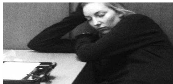
A quick recharge of the batteries over lunch