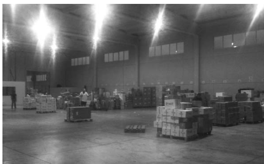
The Carotid workshop in full flow.

Did I not learn from yesterday evening that an early night and a clear head is the way to be most productive in the mornings? The ensuing hours were spent search around the Megaron for the simulators that were 'definitely delivered', again to no avail, and several calls to the man at the warehouse to explain our predicament. He eventually put me through to the delivery driver who confirmed that the British approach of speaking louder and slower in English to a foreigner does not increase the likelihood of them understanding you. With about 20 minutes to spare before the workshop start, the simulators arrived. I was delighted to inform the Professor that they had arrived. 'Oh very good... you do know we have three here already?'